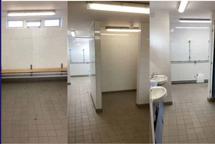
New DT Kitchen. Before and after.